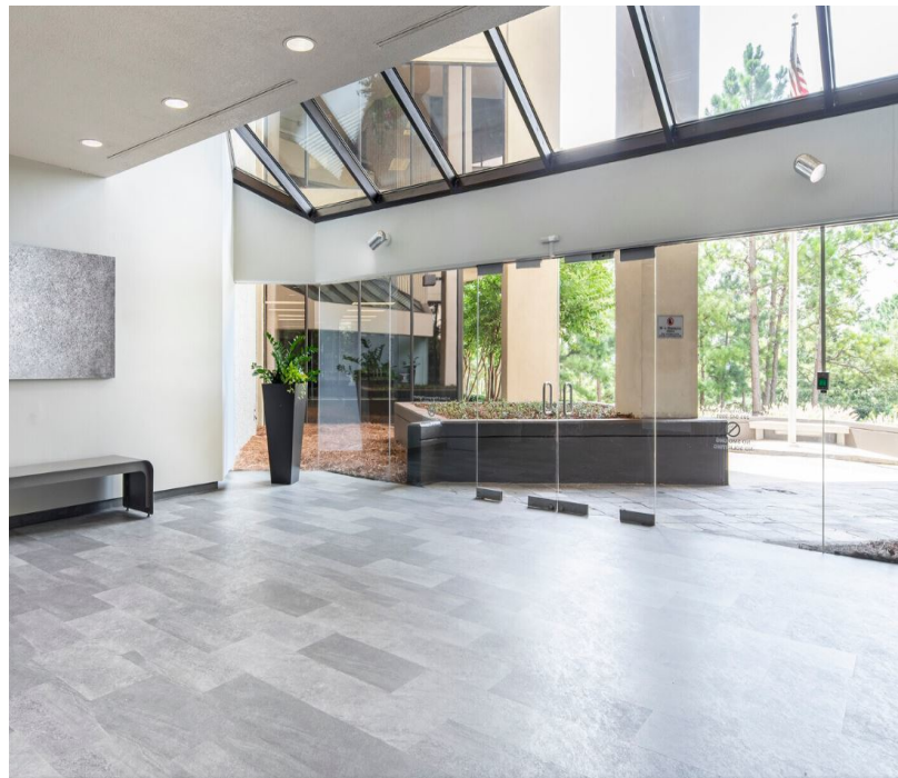
Beacon Ridge Tower Lobby

NO WARRANTY OR REPRESENTATION, EXPRESS OR IMPLIED, IS MADE AS TO THE ACCURACY OF THE INFORMATION CONTAINED HEREIN, AND THE SAME IS SUBMITTED SUBJECT TO ERRORS, OMISSIONS, CHANGE OF PRICE, RENTAL OR OTHER CONDITIONS, PRIOR SALE, LEASE OR FINANCING, OR WITHDRAWAL WITHOUT NOTICE, AND OF ANY SPECIAL LISTING CONDITIONS IMPOSED BY OUR PRINCIPAL. NO WARRANTIES OR REPRESENTATIONS ARE MADE OR IMPLIED AS TO THE CONDITION OF THE PROPERTY OR HAZARDS CONTAINED THEREIN.