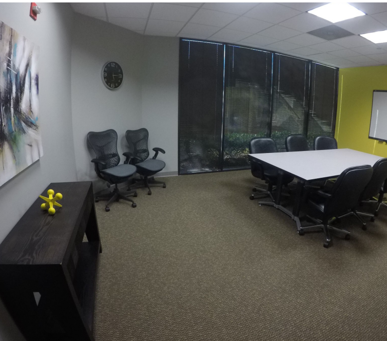
Beacon Ridge Tower Conference Room